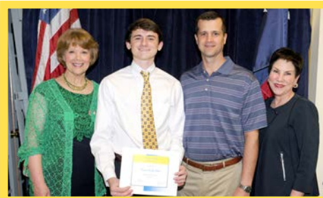
Howard Fitch Scholarship Awarded