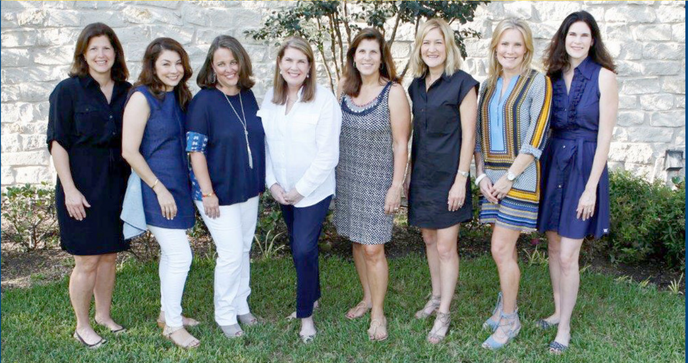
MAD FOR PLAID CHAIRS 2016-2017