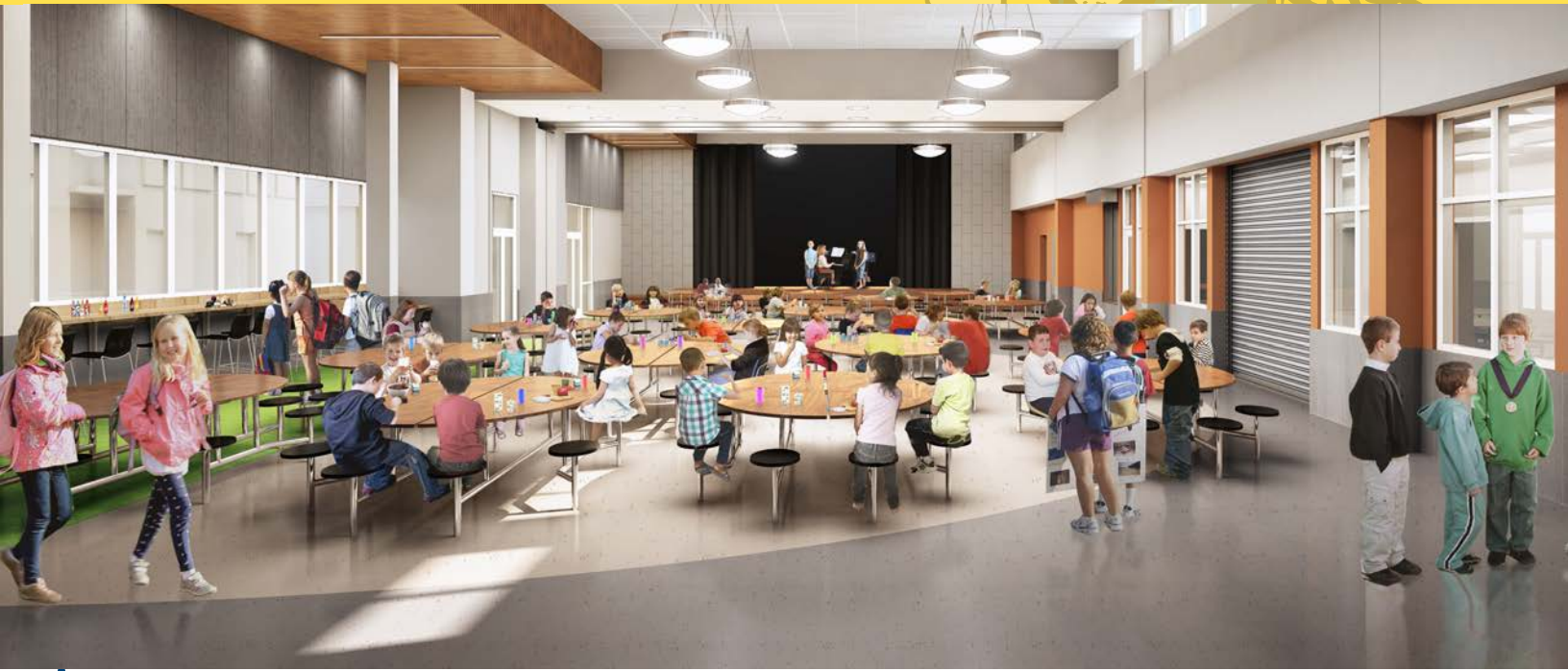
Proposed view of cafeteria in new elementary school

been accepted as the guaranteed maximum price (GMP). This is driven in large part by the current labor market and by rising concrete and plumbing costs. We will obviously continue to monitor this very closely. There are some contingency costs built into the initial estimates for the bond so we do not believe that this will impact our plans on the other projects. The value engineering process is ongoing as we attempt to reduce the proposed cost.