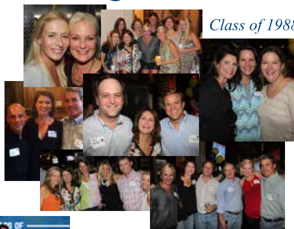
Class of 1988