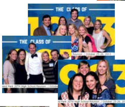
Class of 1993