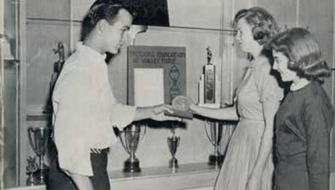
Highland Park Junior High School received a Freedoms Foundation award for last year's efforts to observe and promote the American way. The medal was presented this fall by the chaplain of the United States Senate.