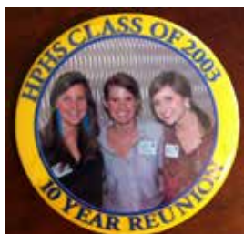
Class of 2003