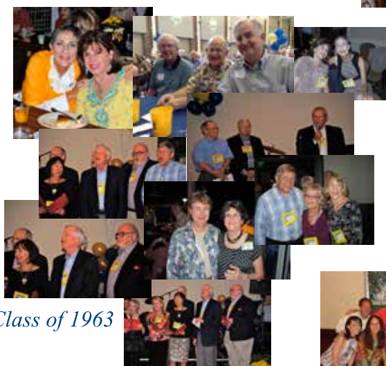
Class of 1963