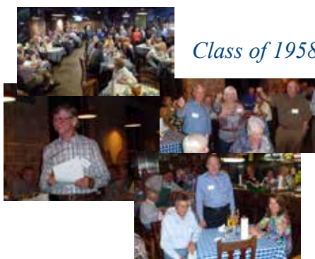
Class of 1958