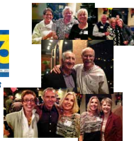
Class of 1968