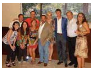
Class of 1983